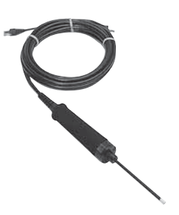
Sniffer probe LP 505